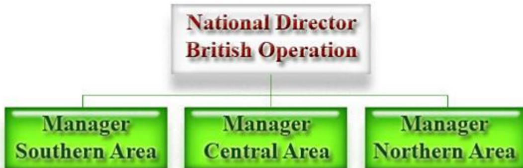
Fig. 2: A Manager in 2 Command Teams